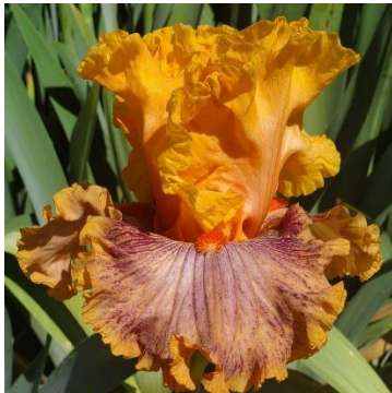
FULLY CHARGED (Sutton 2022) TB, 36", M-L. Standards yellow-orange; falls greyed orange, mottled red-purple, 1/2" yellow-orange band at edge; beards red-orange; ruffled; sweet fragrance. HM 2024