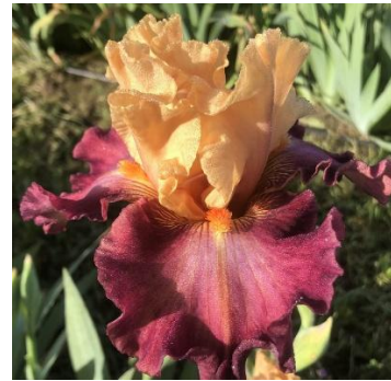
GOLDEN ROSE (Ford 2025) TB, 36", M. Standards gold, pale rose veins, flush at midrib; falls burgundy rose, gold rose below beard, gold rose dart; beards orange, darker in throat; slight sweet fragrance.