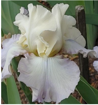
RAIN OF ANGELS (Cadd 2025) TB, 40", L. Standards creamy white, very light yellow overlay fading to white, light yellow at base; falls creamy white, light lavender overlay, beards light lavender base, yellow tips; pronounced musky fragrance.