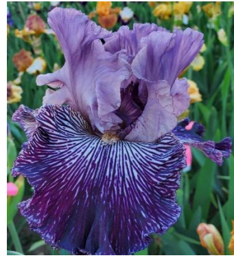
PURPLICIOUS (Van Leire 2024) TB, 36", M-L. Standards light to grey purple; falls white, with dark purple veining beards white base, orange tips; absent fragrance.