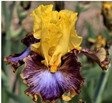
SHIFTING GEARS (Keppel 2023) TB, 36", E-M. Standards chrome lemon; falls pale lavender center ground, progressively heavier overlay blended Chippendale, brass edge; beards golden glow. HM 2025