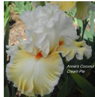
ANNIE'S COCONUT CREAM PIE (Kanarowski 2024) TB, 36", E. Standards pristine white, touch of cream at base of midrib; falls pale yellow-cream, lighter at beard, darker edge, quarter-inch white rim, beards red-tangerine, brilliant and large; pronounced sweet fragrance.